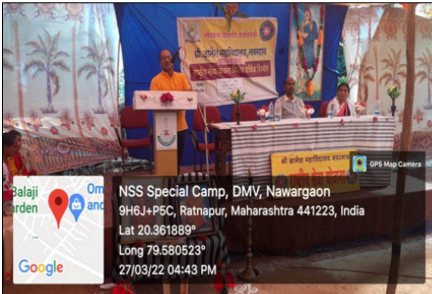
Guest of NSS Programme